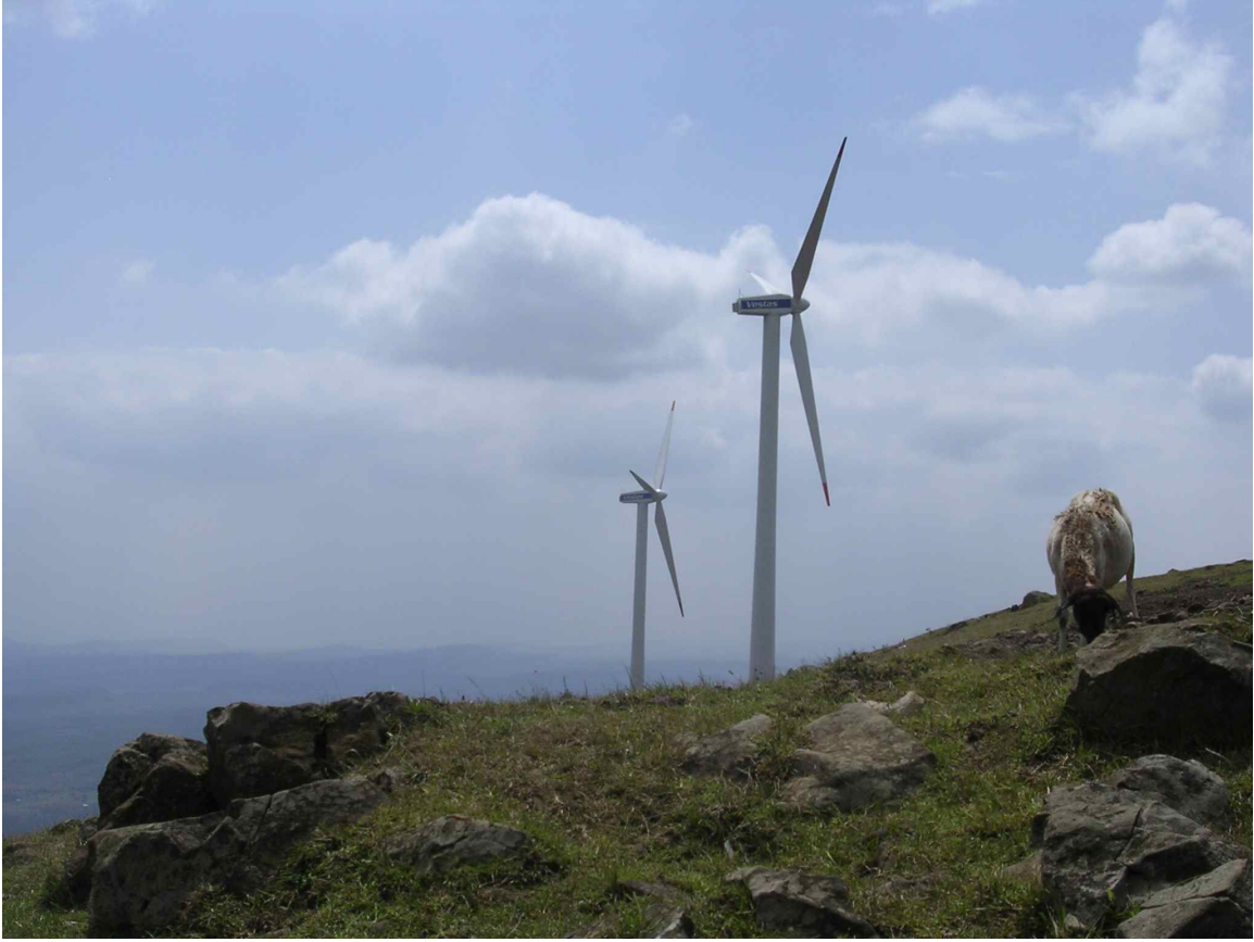
Figure 2: Vestas V52 Wind Turbines (Ngong Hills, Kenya)