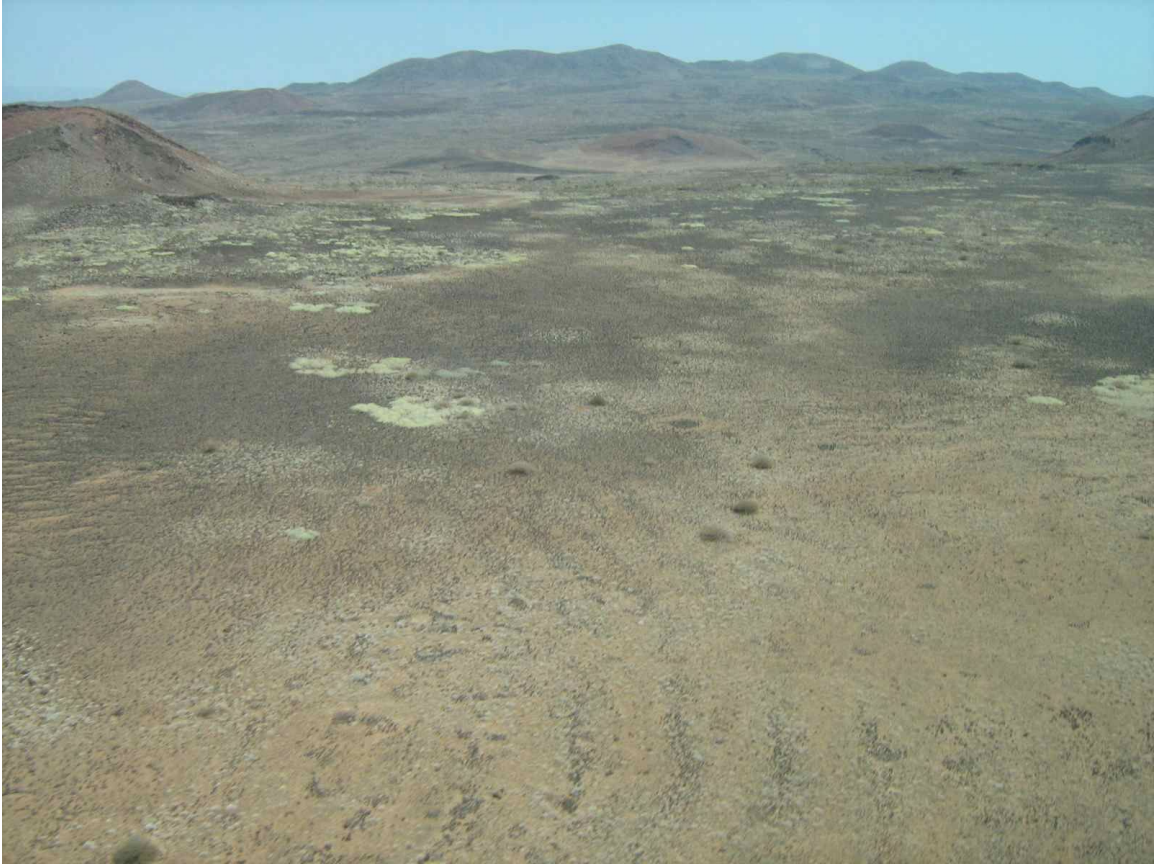
Figure 4: Project area