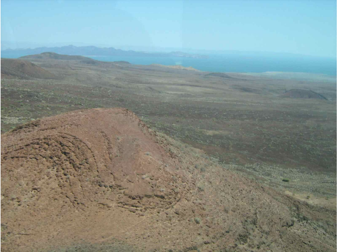
Figure 3: Lake Turkana